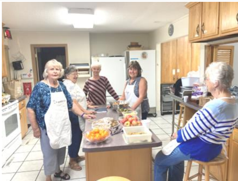
VBS True North